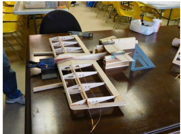
Jeff's stab, we were watching the glue dry