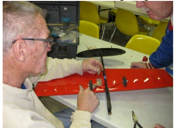
Again teamwork adding lead-outs