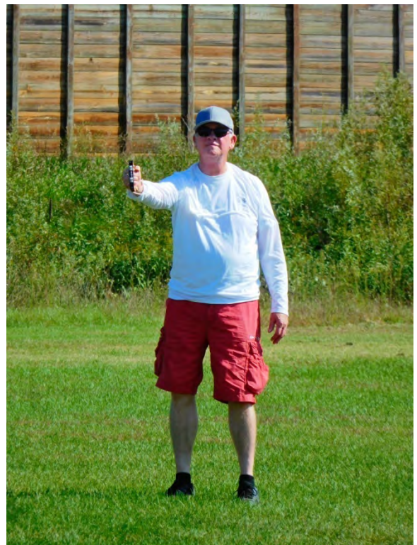
Looks more relaxed on the handle 9/9/2018