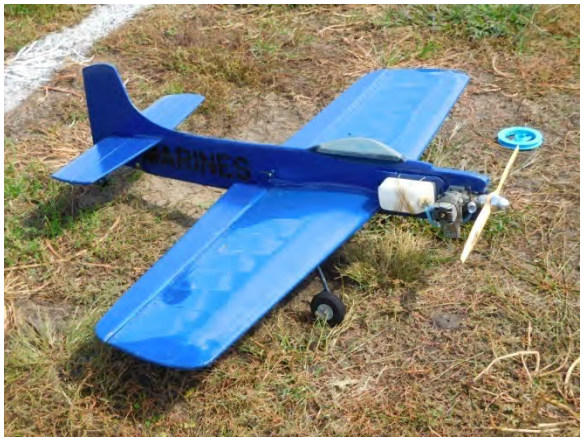
My Skyraider S.T. 51

Unless the rain and wind don't spoil our Sunday I'll be out there again.