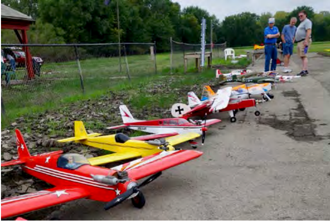
RC Planes on the Tarmac