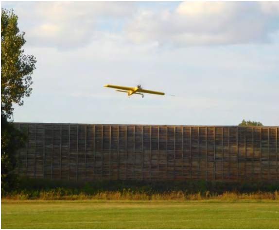
The Vector is a pretty sight going by