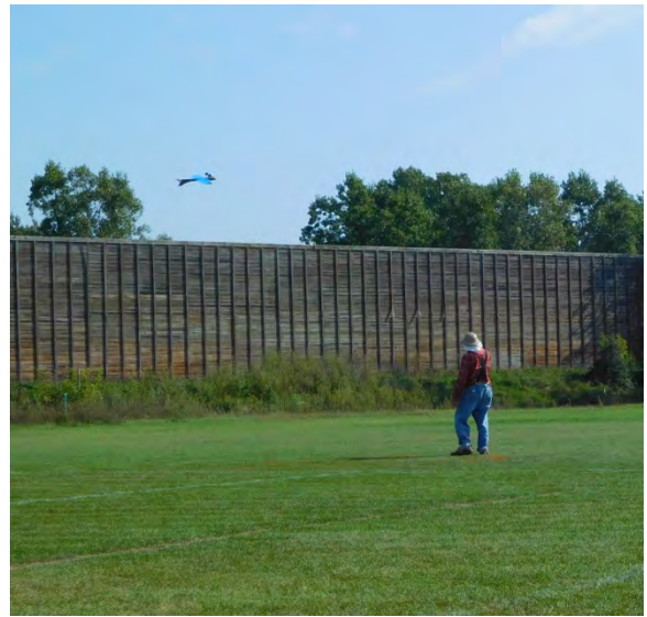
Inverted Gotcha 2000