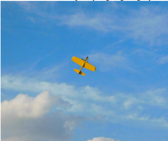
Doing a wingover catching the evening sun 8/30/2018