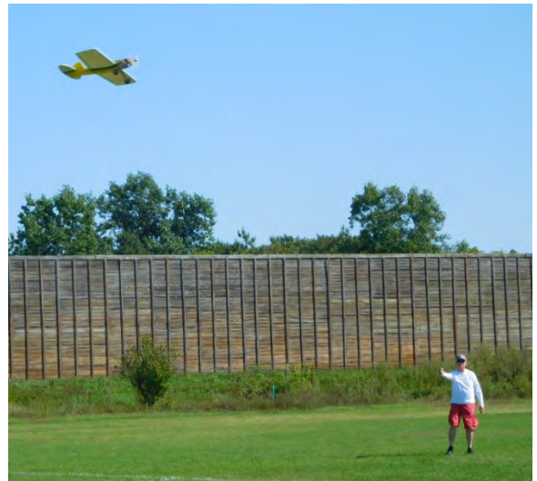
Another Ringmaster flight smooth and steady