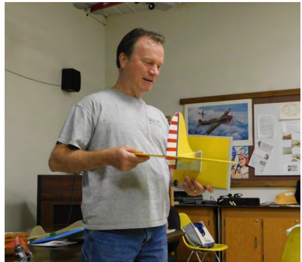
Recycled tail feathers, turned into a conversation piece for the shop wall.