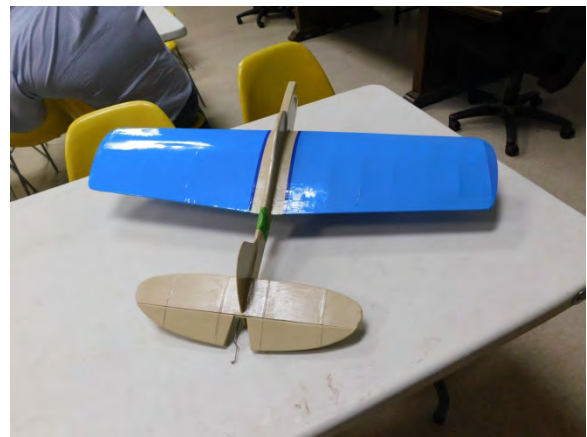
Tom covered this Ringmaster with Monokote using tips from Ivars that was learned during our winter build sessions. The best place and time to learn, and pass on the tricks of model building.