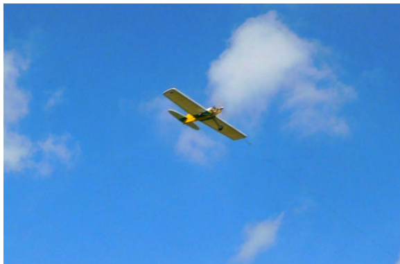
Steve's Ringmaster pretty site against the blue morning skies