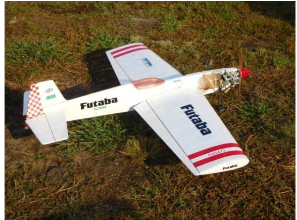
My ARF Tutor