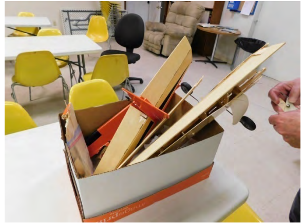
Downsizing for transport, up-line broke what a shame. Let's all check our equipment, so we don't see any more downsized planes.

Well Sat is almost here and time for another mowing and fly date with the field see you there.