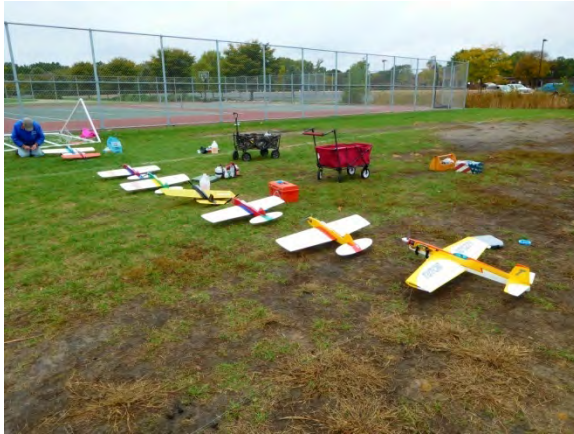
With all the Ringmasters lined up their always has to be one oddball in the crowd