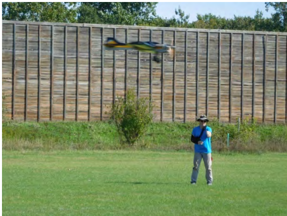
Shug with the Prowler