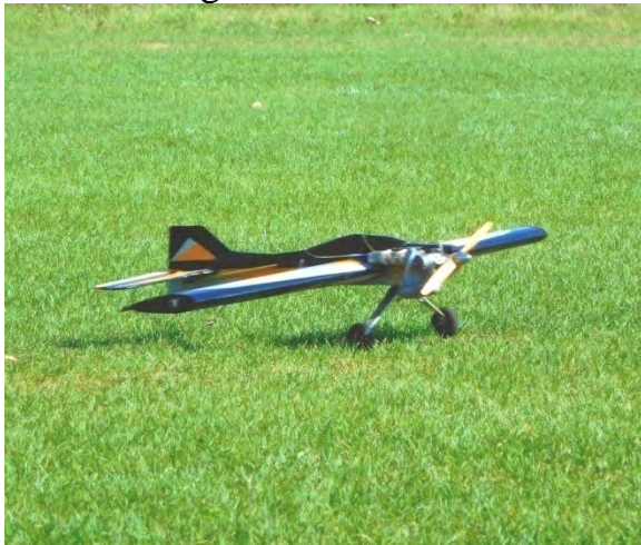
Just landed at end of the day