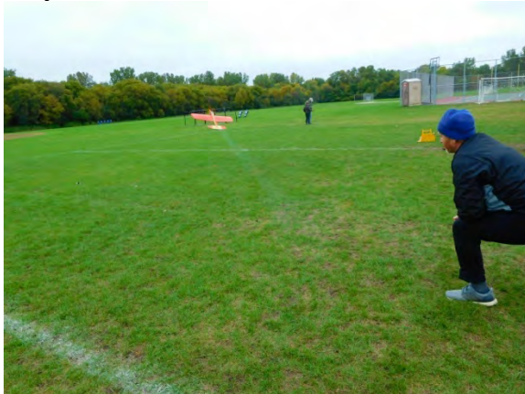
Another Ringmaster on its way