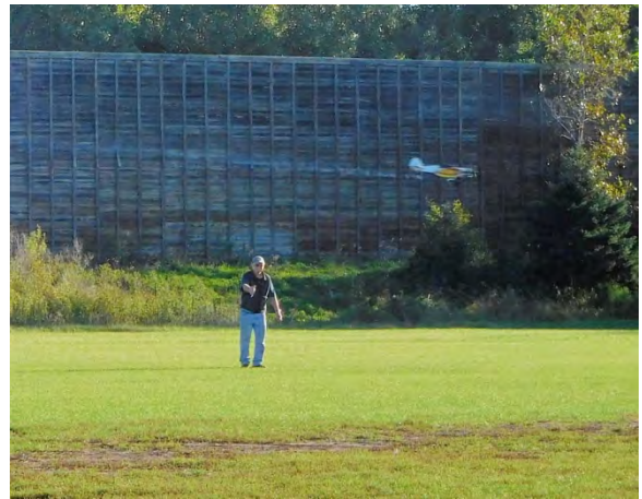
Dave getting circle time

The one armed Shug had to show us all how it is done. Flying the Prowler the first familiarization flight he then put in some full pattern flights that looked really good.