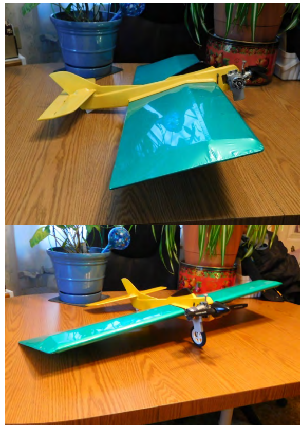
As you can see my Fury is ready for first flight