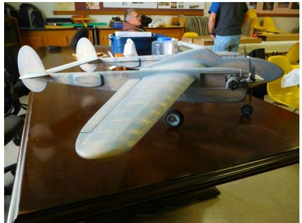
P-38 Bigger is better