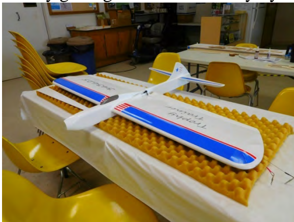
What a great repair. This plane received heavy damage at Polk City.