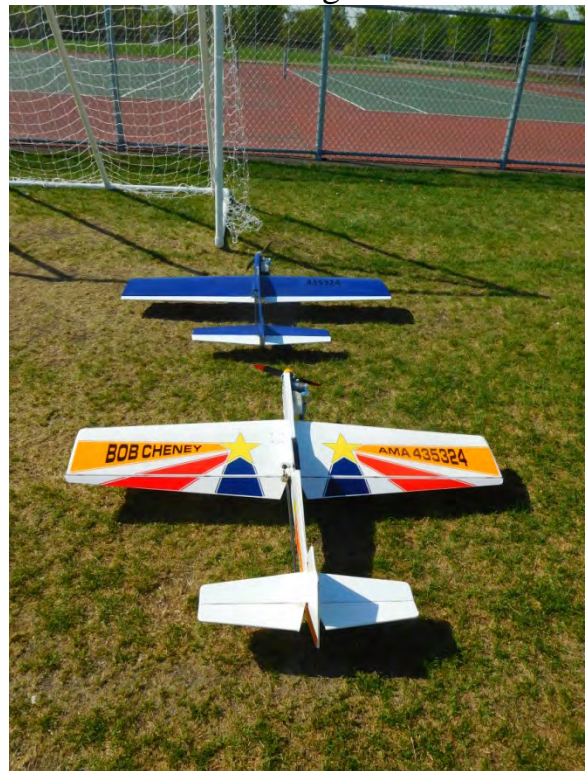
The Tutor II and the John plane