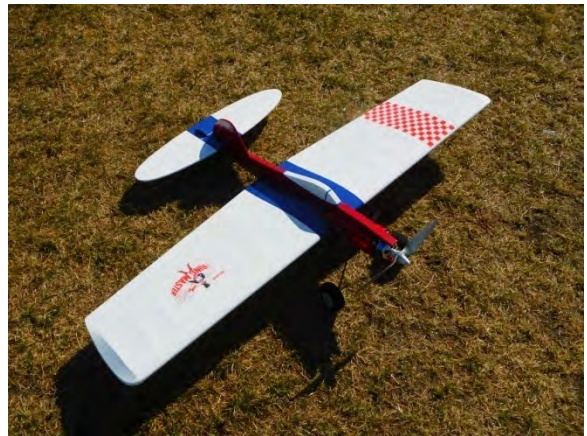
Electric Ringmaster ARF