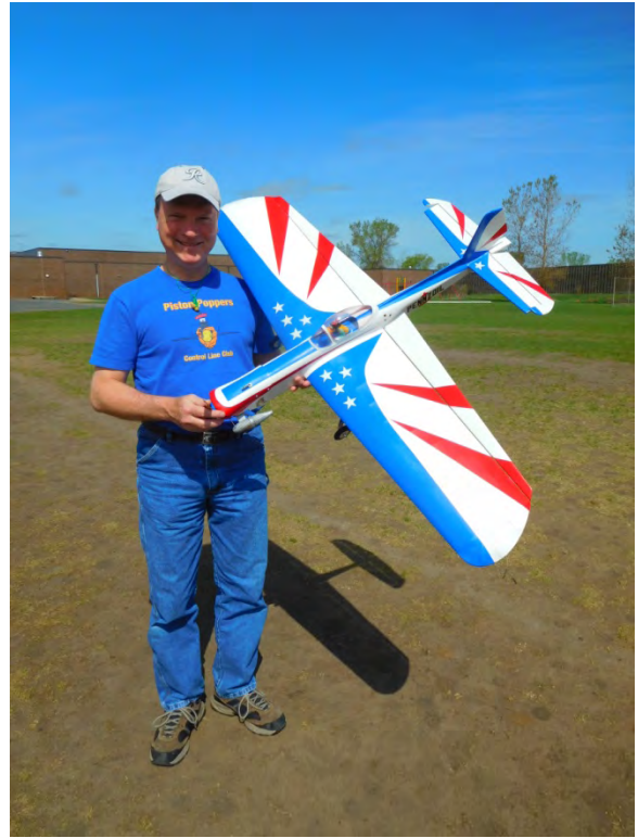
Tom's Chipmunk with a Goofy for a pilot both inside the cockpit and inside the circle.