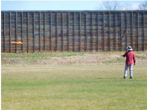
Shug and the Force