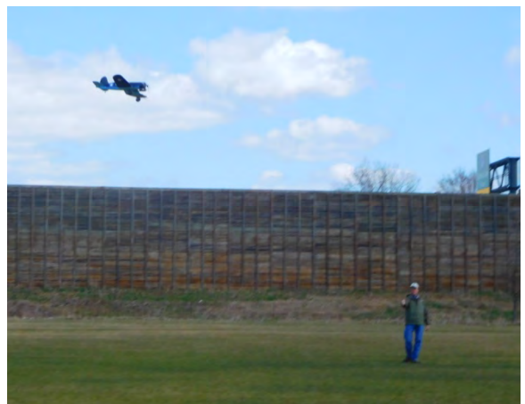
Tom flying the Corsair