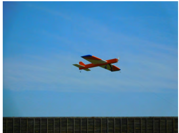
The No Name Plane of Ivars