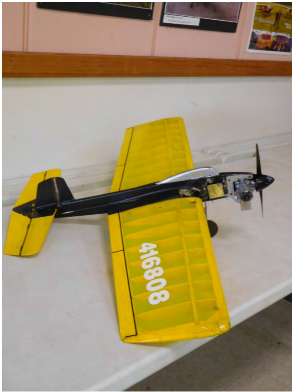
A tired Ringmaster