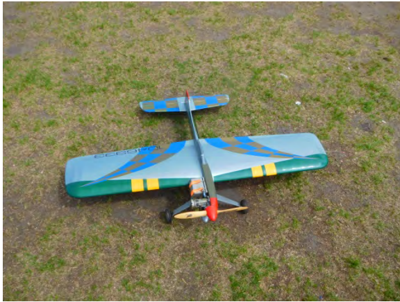
Rachel's Shark 402