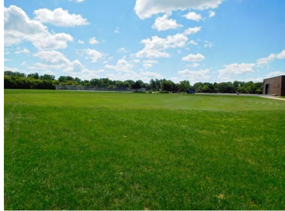
What is wrong here?

Freshly mowed, light winds, low humidity and temps in the upper 70's. I have an important question: What is wrong with this picture?