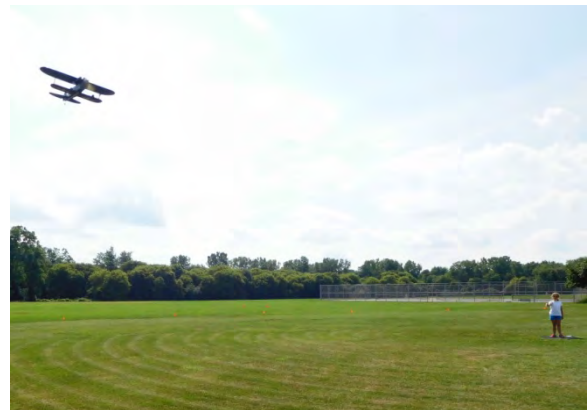
Rachel and the Flying Fool

I wanted to see the Flying Fool from outside the circle so I asked Rachel to put up a flight. What a girl, she had a great looking flight better than me by far.