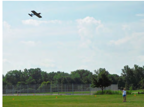
Rachel with the Shark 402

I wanted to see the Flying Fool from outside the circle so I asked Rachel to put up a flight. What a girl, she had a great looking flight better than me by far.