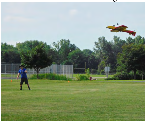
Shuggy with the Strega