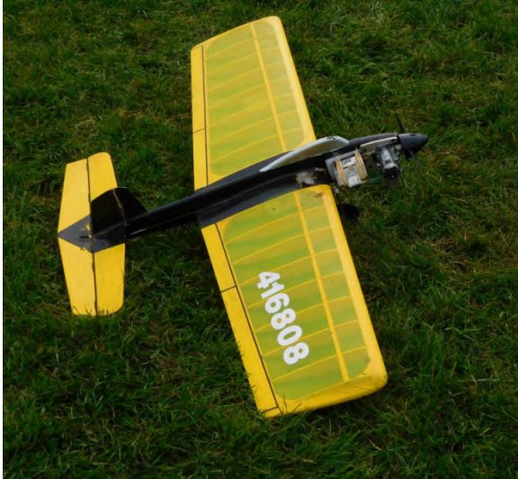
Ugliest Ringmaster Fox 35