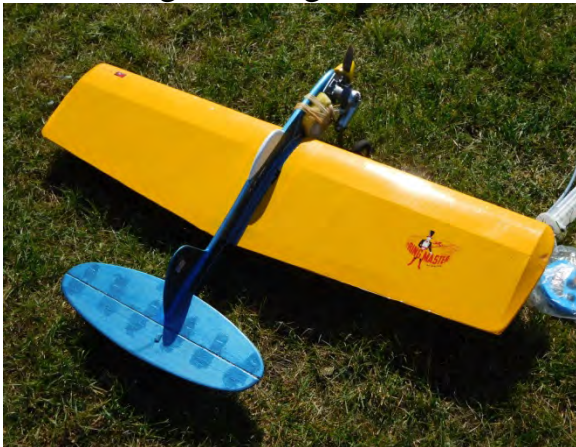
The warped wing Ringmaster Fox 19