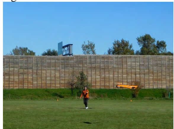
Inverted Primary Force

Finally, Rachel flying her Shark 402 with a proud papa looking on.