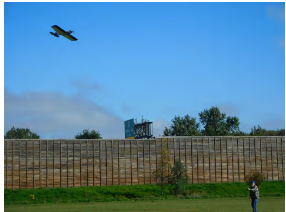
Terry flying the Ringmaster

The ringmaster Fly-a-thon continues tomorrow I plan to get out and make more flights, getting our club noticed.