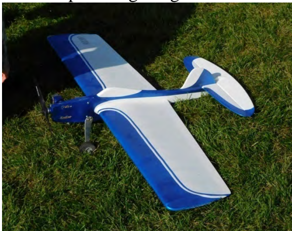
Best looking Ringmaster OS 40