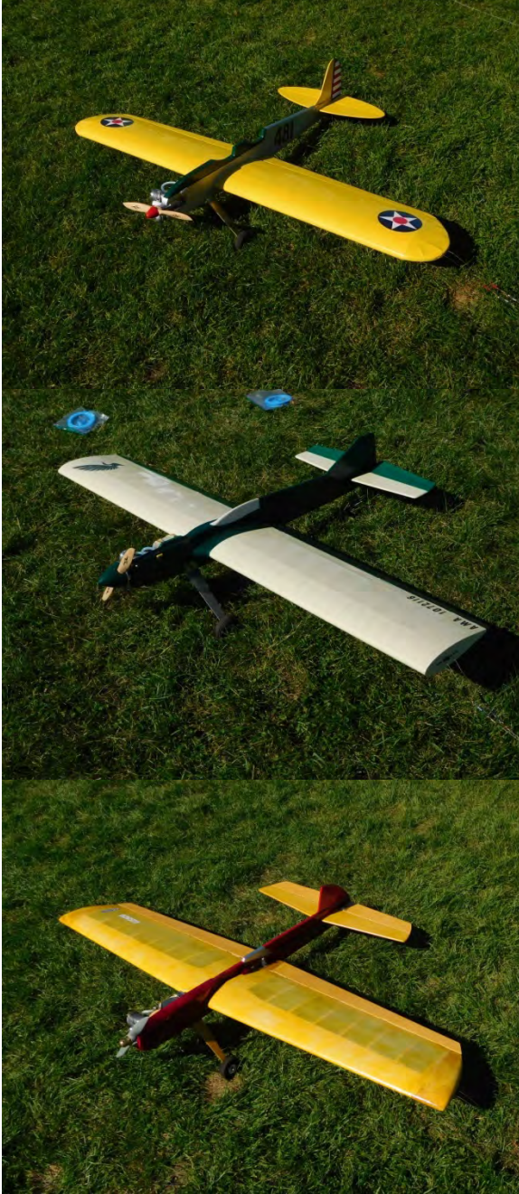
Still not Ringmaster's