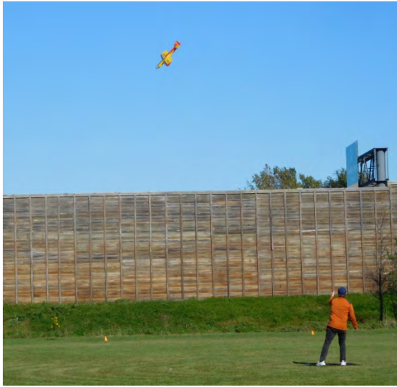
Strega in action