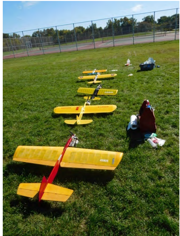
Air taxis anyone?

The way the planes were pitted it appeared that everyone had brought out yellow planes that just happened to be pitted in a row. Must be an air taxi service.